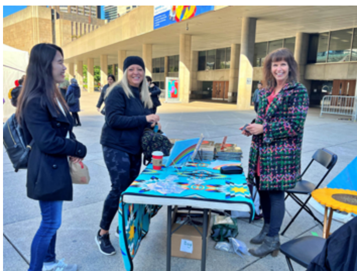
Fundraising for Our Children's Medicine.