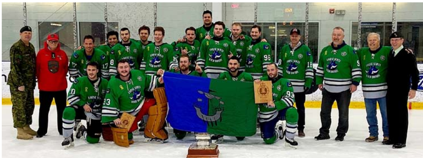
The Lorne Scots - 2019 champions