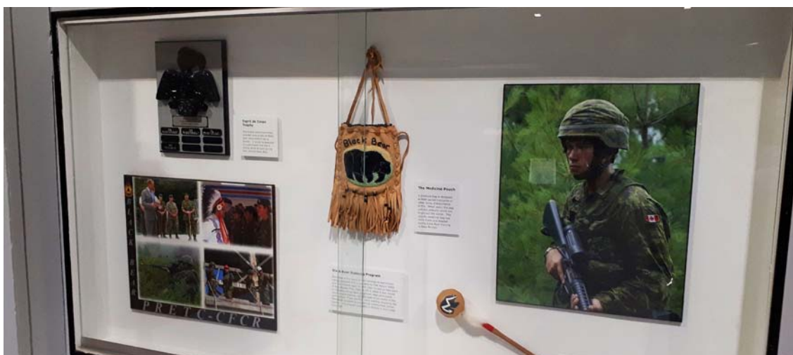
The Black Bear Training display