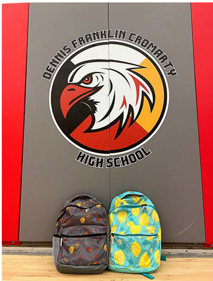
Backpacks donated by Costco arrive at DFC.