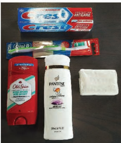
DFC Male Hygiene Kit

I want for all our students. There is an ongoing need for these life essentials, so this generous donation by Procter and Gamble will go a long way in providing our students with a happier and more normalized Canadian high school experience.”