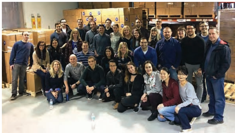
DFC Hygiene Kits were packed by P&G staff